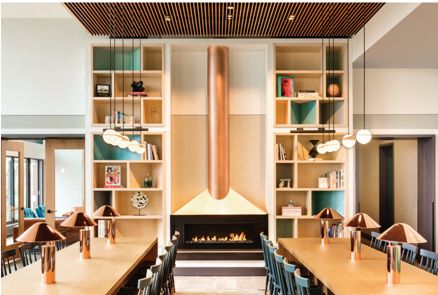
The Living Library is anchored by a copper fireplace.

"The library includes an eclectic mix of manufactured and bespoke elements that make the space both inviting and inspiring. The custom copper fireplace and millwork anchor the space. Local artist Tom Slazinski created an abstract cityscape in the form of a dip-dyed wall that runs the length of the north wall. Gravel plant beds and ipe screens blur the lines between inside and out, bringing the blue of the sky and the landscape of the outdoor deck into the room,"