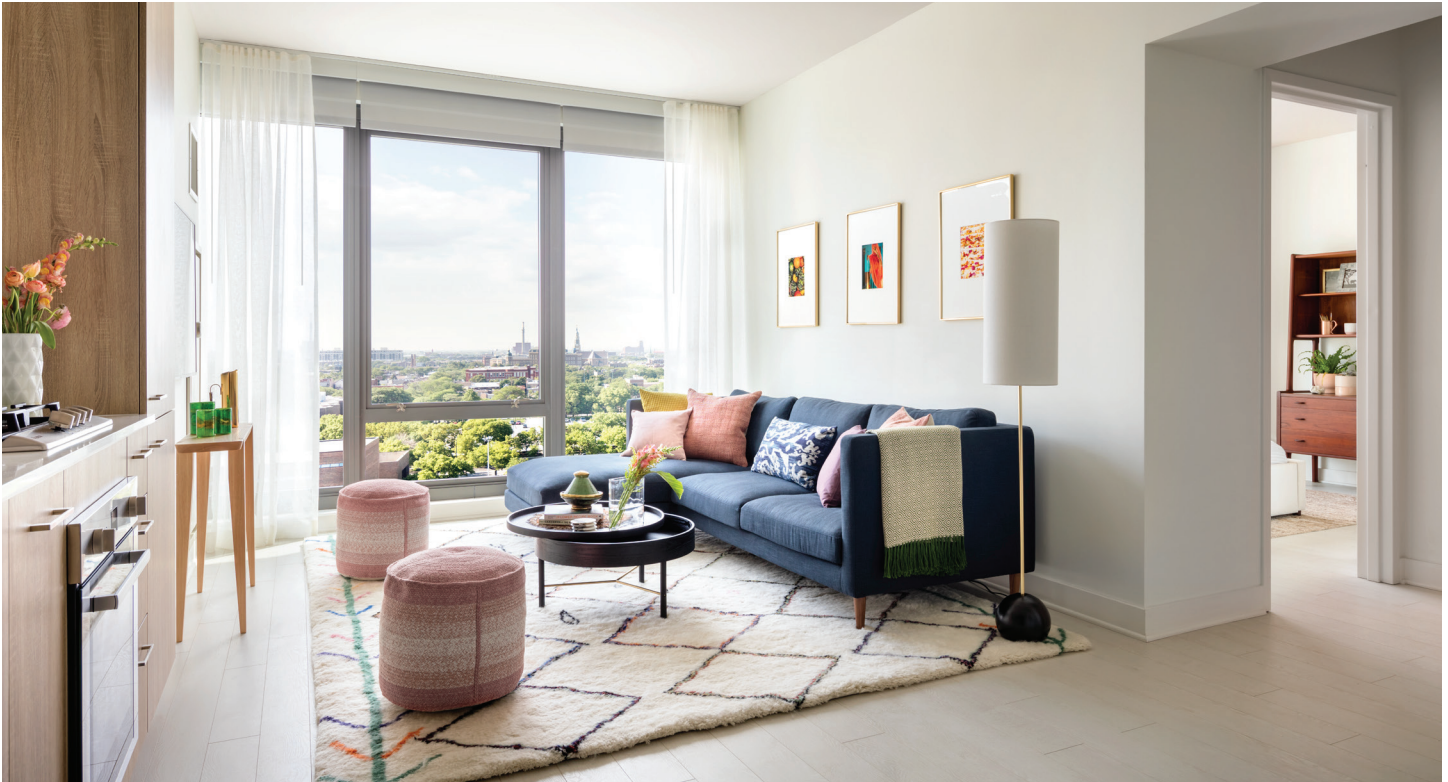
The living room of the one-bedroom unit