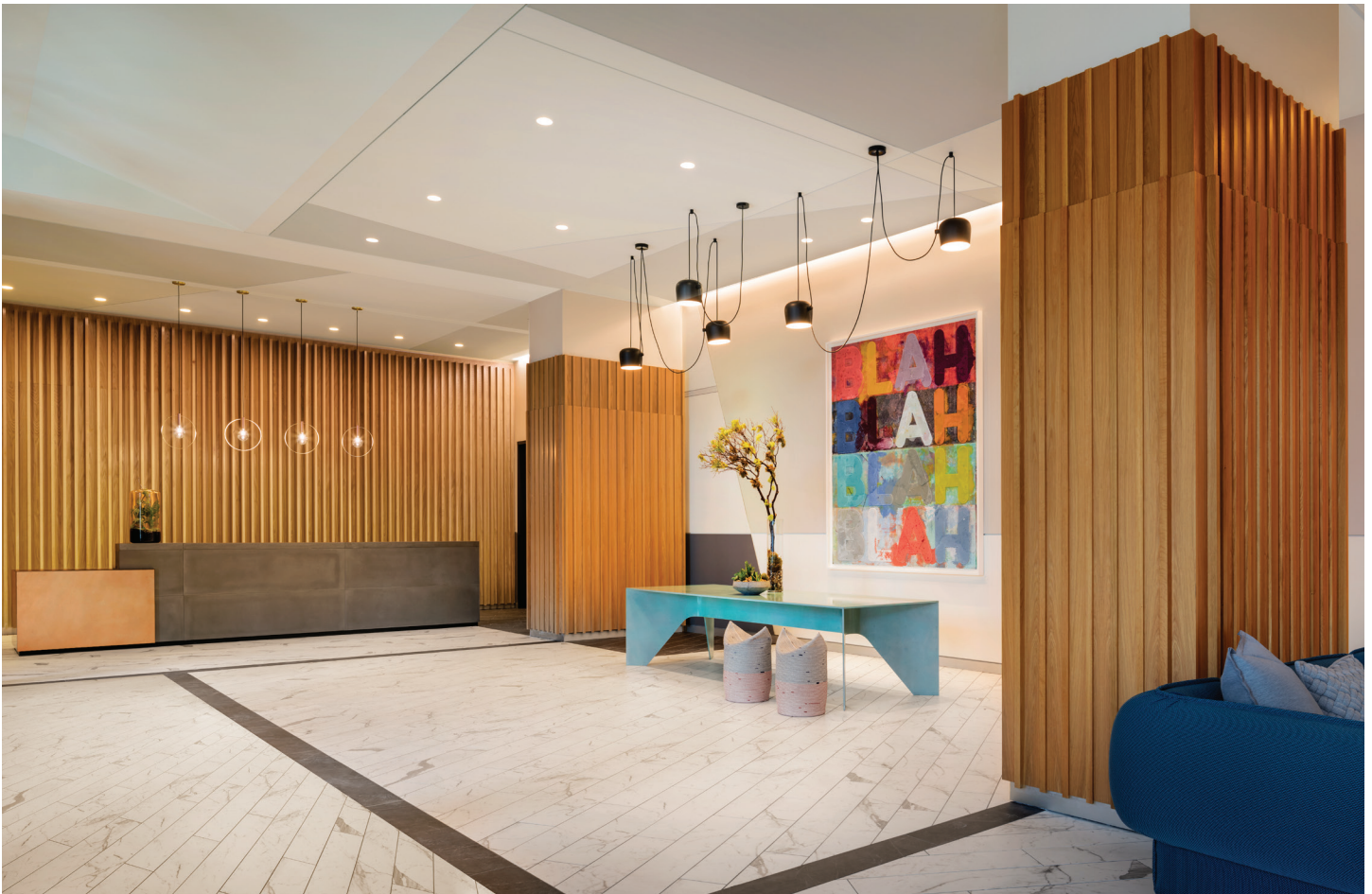
The building's lobby features Mel Bochner's "Blah Blah Blah" piece.