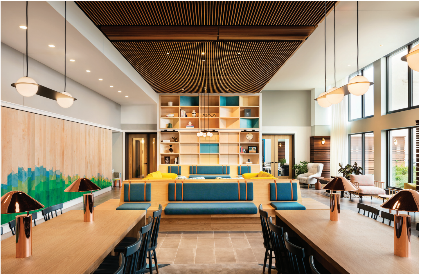
Warm wood and copper details, along with Tom Slazinski's dip-dyed wall, create an intimate and inviting lounge and work space.