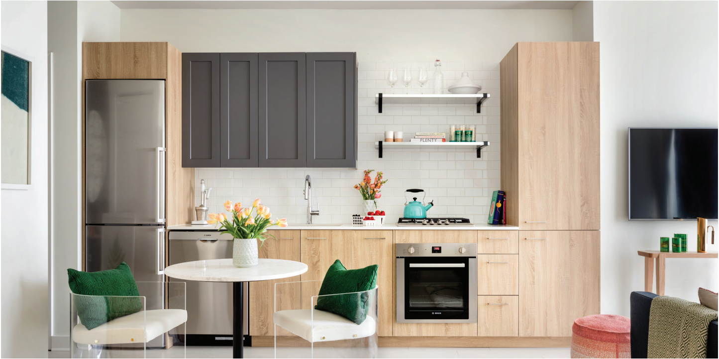
The kitchen of the one-bedroom unit

All kitchens feature custom cabinetry, quartz countertops, white subway tile backsplashes, open shelving, and high-performance Bosch appliances. Additional features, such as mobile, stainless-steel islands, are available in certain plans