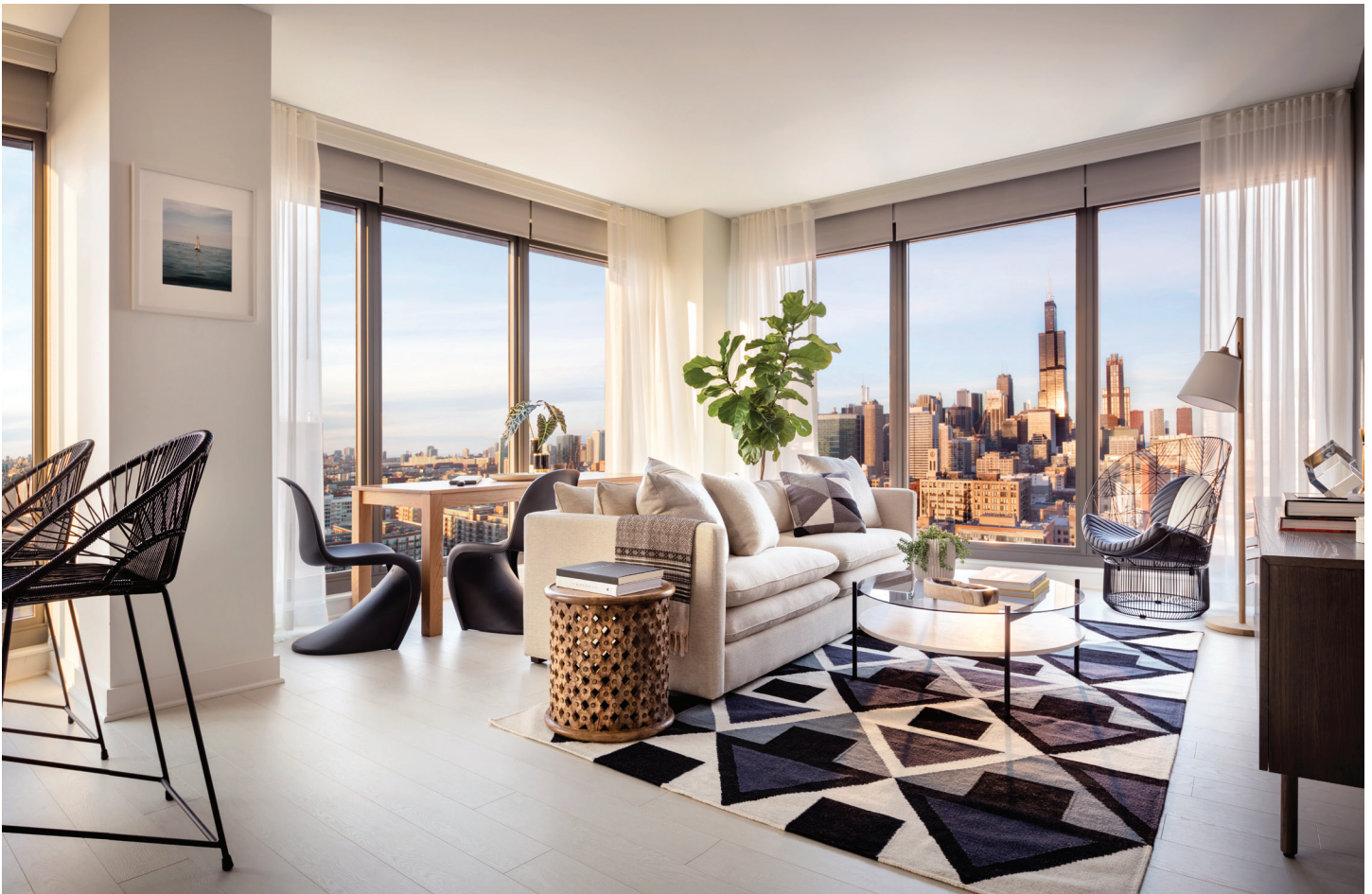
The living and dining area of a two-bedroom unit

Developers Related Midwest worked closely with New York-based firms Morris Adjmi Architects and Reunion Goods & Services over a four-year period to bring Landmark West Loop from concept to completion.