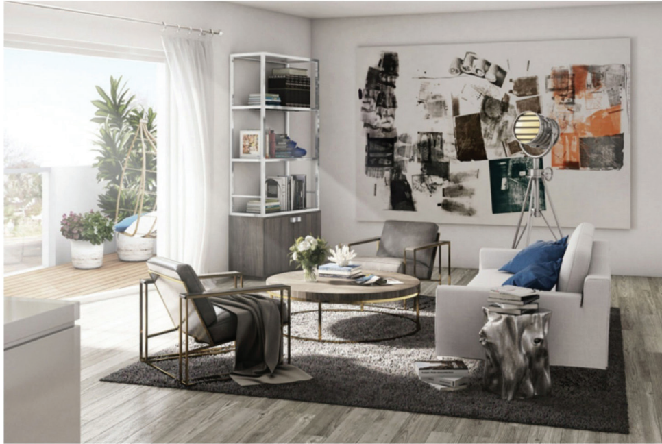
AIRE Santa Monica

When construction is complete at AIRE Santa Monica, it will be an eco-conscious dweller's dream. Clerestory windows will reduce energy consumption by allowing more natural light to flow into the three buildings, situated around a courtyard with drought-resistant landscaping. It's beyond bike-friendly: two bikes are provided to each residence. Residents can tune up the bikes in the on-site bike room, and there's bike parking in the basement garage. Sales will begin in November.