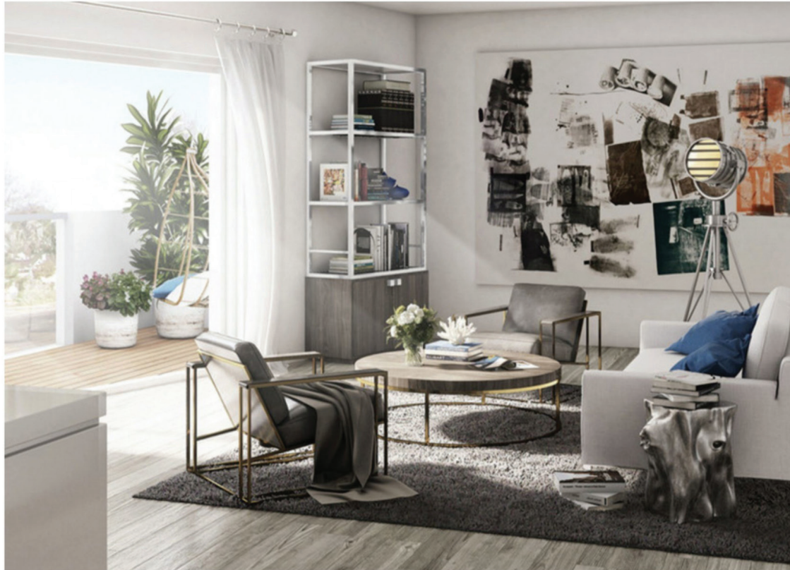
A residence at the AIRE Santa Monica. AIRE SANTA MONICA

ORIGINALLY PUBLISHED ON SEPTEMBER 25, 2016 | MANSION GLOBAL | SAVE ARTICLE