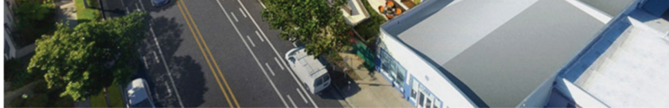
AIRE Santa Monica

When construction is complete at AIRE Santa Monica, it will be an eco-conscious dweller's dream. Clerestory windows will reduce energy consumption by allowing more natural light to flow into the three buildings, situated around a courtyard with drought-resistant landscaping. It's beyond bike-friendly: two bikes are provided to each residence. Residents can tune up the bikes in the on-site bike room, and there's bike parking in the basement garage. Sales will begin in November.