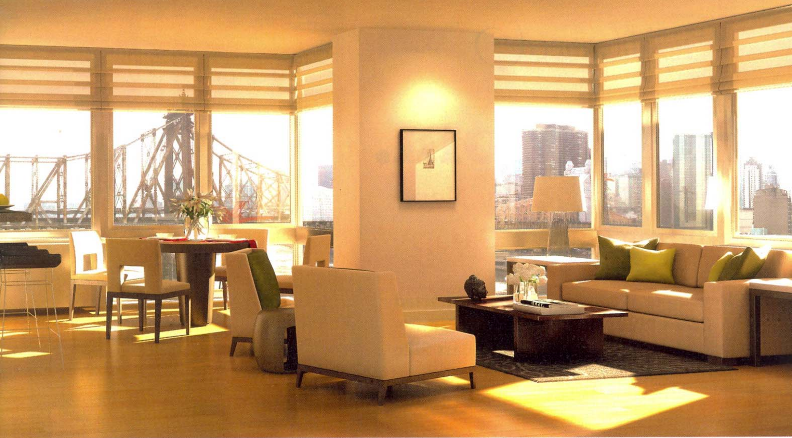
Artist renderings by A. J. Silverman

(with an adjoining rooftop sundeck) where you can watch movies, play pool, or host birthday parties; a fitness center and yoga studio; and rooftop cabanas. Plus, a variety of shops and restaurants are located just steps away at Riverwalk Commons, including a Duane Reade, Starbucks, a hair and nail salon, a dry cleaner's, and Japanese and Italian restaurants.